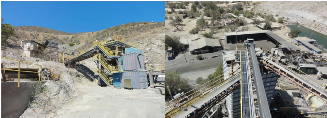
Figure 2. A view of the belt leading to the three tertiary cone crushers (left) and the concentrate shed at Cinabrio (right).