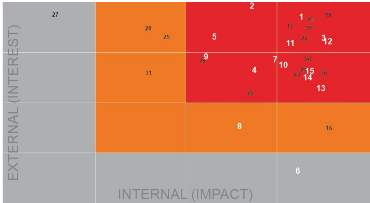
Figure 4. Materiality matrix mapping the topics most relevant to the Company and its stakeholders against internal impact on the Company and external interest by stakeholders.

With the results of this materiality assessment, the Company has now commenced the process of data collection and verification in order to identify and implement measures relating to these material topics. The Company will engage in on-going stakeholder consultation to keep this list of material issues up to date.