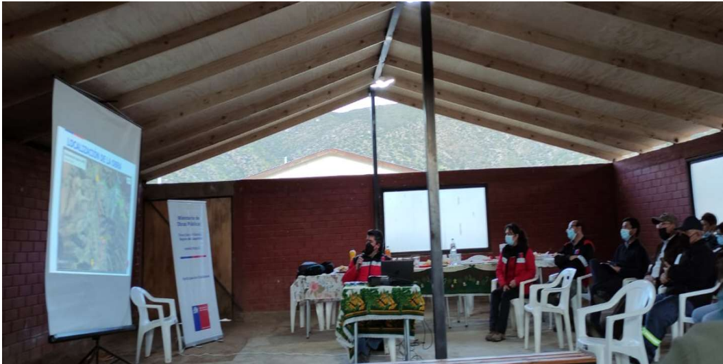
Figure 5. Community meeting to discuss a road paving that will benefit BMR and local communities alike.

Furthermore, BMR understands the importance of maintaining a consistent stakeholder engagement plan. At the Punitaqui copper mining complex in Chile, the Company holds regularly scheduled community meetings (at least once per calendar quarter, if not more frequently) to address any issues or concerns raised by community representatives, on behalf of their constituents. BMR has maintained, and will continue to maintain, an open and honest dialogue with the aforementioned communities.