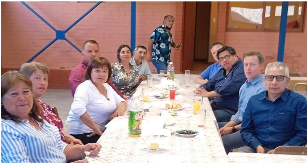
Figure 6. Visit by the management team of BMR with community members from Potrerillos Alto.