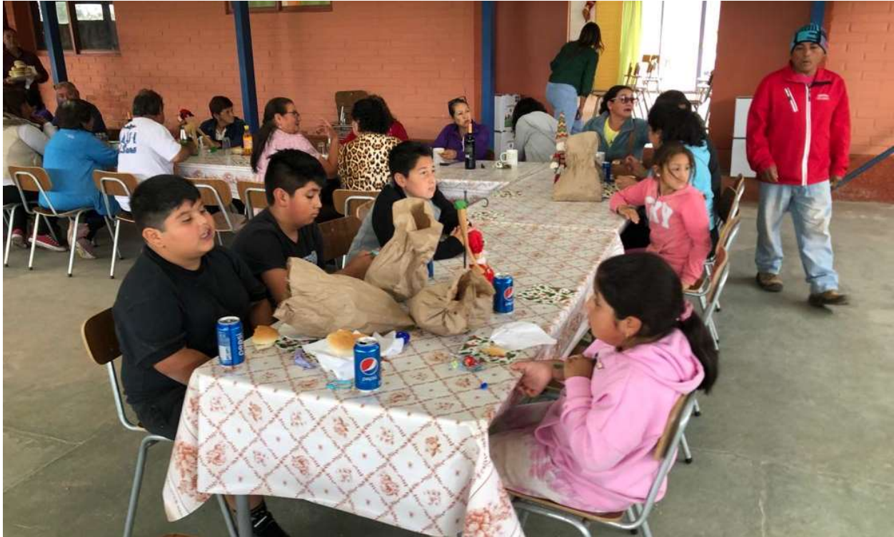
Figure 9. Christmas reception hosted by BMR for the community of Potrerillos Alto in 2022.

BMR prides itself on working with the communities in the areas we operate in and have invested in community and social initiatives at our projects sites to support these communities. An example of this is the investment made at the Punitaqui copper mining complex in Chile. To support aid and improve the local community, BMR has agreed to fund the construction of a water well for the people of Potrerillos. The well will directly benefit the people of Potrerillos for many years to come. Water sourced from this new well will be solely for members of the community for personal usage, replacing the current situation of water being trucked in to supply their community water reservoir. This new well will not only increase the amount of available water, but also lower the costs by eliminating the trucking of water that is currently taking place.