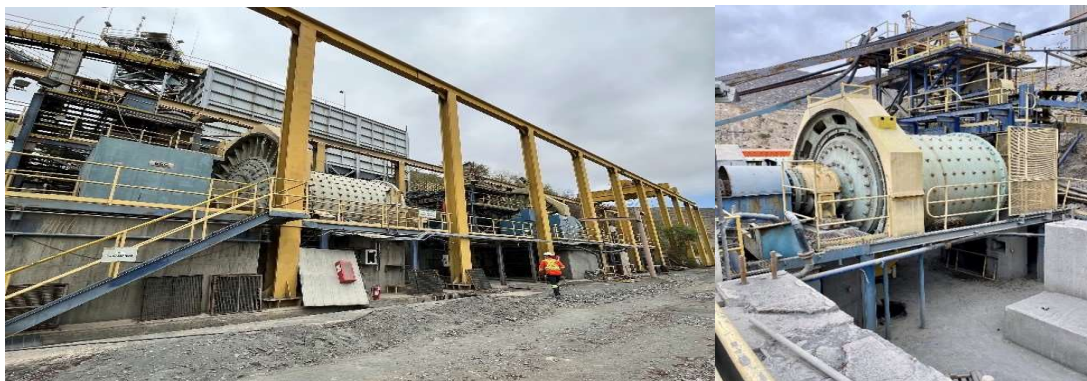
Figure 3. The two primary grinding mills on-site (left) and one of the two ball mills in the secondary grinding system (right).